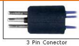
3 Pin Connector